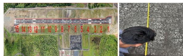
Figure 3. Number of Samples (Left); Damage Examples (Right)

Field survey results indicate that the runway pavement at Atung Bungsu Airport exhibits predominant damage in the form of weathering and raveling across nearly all segments, from STA 0+000 to STA 1+500. The inspection was conducted by dividing the 1,500-meter runway into 15 sample segments, each measuring 100 meters in length and 30 meters in width (see Figure 3). Visual documentation was used to capture the actual surface distress conditions.