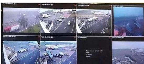
Figure 1 Visual Monitor CCTV Room

off aircraft block on Apron C, and discovery of inappropriate Ground Support Equipment and discovery of Foreign Object Debris. Following is the CCTV footage on the Juanda Airport Apron: