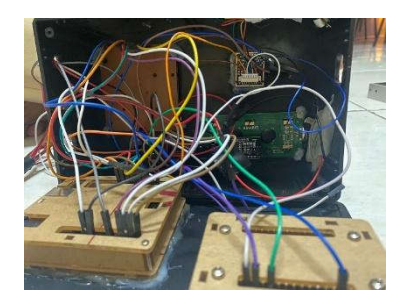
Figure 2 Tool design results

In figure 2 the results of the design and integration of the tools to be used. The Arduino ATmega328 module on the left is integrated with several modules, namely pushbotton, LCD display, keypad, and fingerprint. In the right picture is the NodeMCU ESP8266 module, one of the Arduino modules that can be connected to the internet network, and the module is integrated with a buzzer, reedswitch / door sensor, and also the internet network to connect to Telegram Bot as monitoring that the door is open or not and the door has been locked again or not.