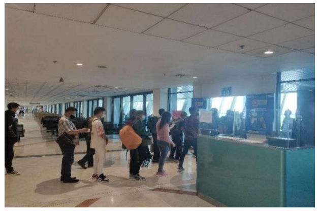
Figure IV.2 Boarding gate of Batik ID 6401