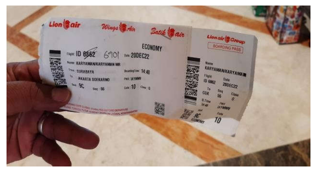
Figure IV.1 Boarding Pass of Batik ID 6401

Based on field observations, the author found that currently the level of compliance of Airlines with gate planning that has been made by Terminal service officer (TSO) personnel is still low. This is evidenced by the direct or sudden gate changes made by the Airlines . Of course this will cause discrepancies regarding the gate information that will be used by each flight. As an example of gate planning on the following flight: