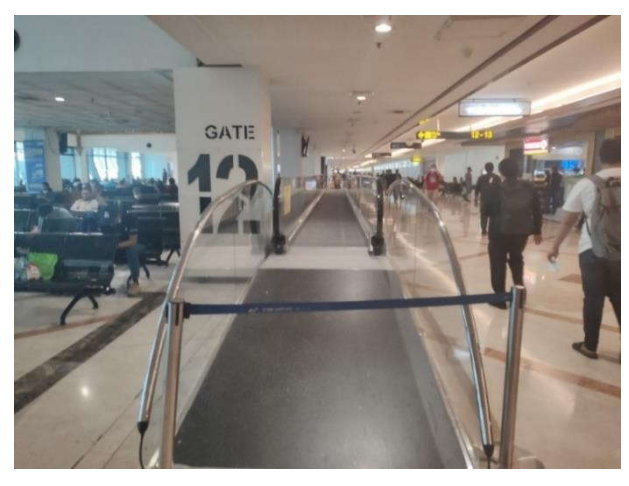
Figure IV.3 Boarding gate ID 6401 used by Airlines

The author provides a solution to the problem by dividing it into 3 parts: