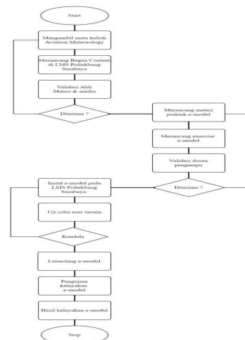
Figure 2 Research Instrument Design

In this final project, the author made an e-module of Aviation Meteorology material according to the syllabus in the Aviation Communication study program. It contains 2 credits (Semester Credit System) consisting of 14 meetings, 12 face-to-face meetings, assignments, and practice as well as UTS and UAS. The content of this e-module includes PowerPoint, pictures, and exam questions. Then this e-module will be implemented and uploaded to the Learning Management System website.