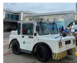
Figure 2 Aircraft Towing Tractor that uses Unsuitable Tires at Parking Stand 2