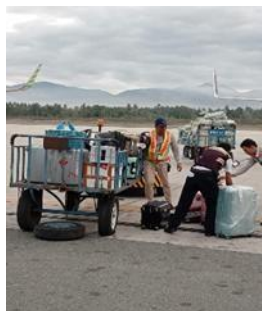
Figure 6 GSE Damaged While Operating on Service Road