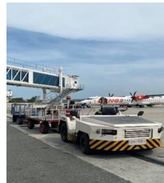
Figure 5 GSE Damaged While Operating on Service Road

and the pavement surface, which are essential for supporting efficient airport operations. Secondly, the oil leak creates a significant safety hazard, as the slick surface of the apron increases the likelihood of slipping incidents involving other vehicles and equipment, thereby threatening safety in the apron area. Immediate handling and repair of this leak are crucial to prevent further damage to apron infrastructure and to maintain high safety standards in airport operations. Proactive repair measures, including cleaning the affected area and fixing the leaking equipment, should be undertaken to prevent similar incidents in the future.