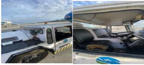
Figure 3 Rusty Aircraft Towing Tractor at the Parking Stand

disrupt operations and add operational burdens. To prevent further risks and ensure safety, it is crucial to promptly replace the unserviceable tires and conduct a thorough assessment of other GSE conditions.