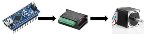
Figure 3. Testing Motor Stepper

This final project, the author will test the stepper motor according to the time that the author has set.