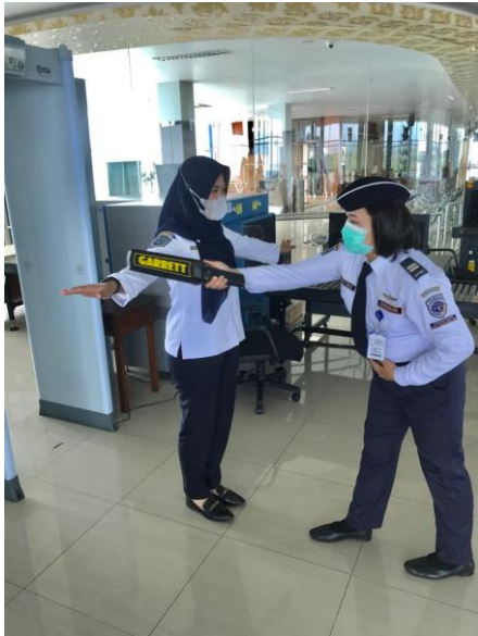
Figure 4.2 Avsec Male Personnel In full uniform