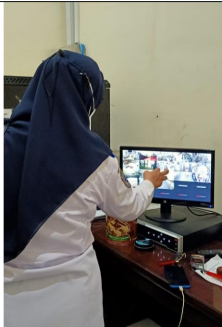
Figure 4.3 Passenger Check with Hand Held